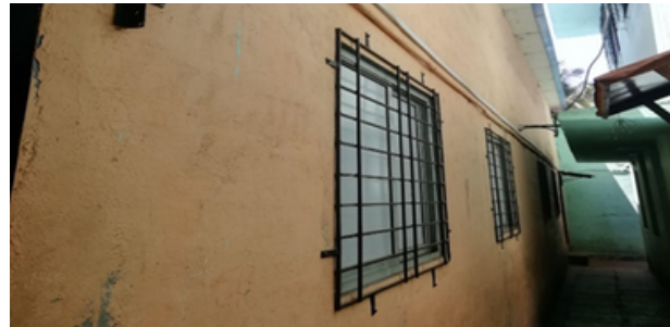
Exterior view of the constructed classroom