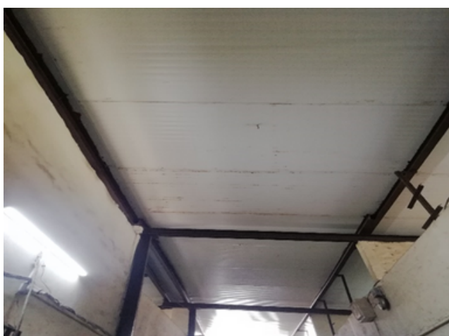
Replaced asbestos roof with PUF and new beams can be seen

After the intervention, the asbestos roofs were replaced with PUF roofs, resulting in an increase in the height of the classrooms and a reduction in the temperature, making them more conducive to learning. The walls were made smoother and the leaks were fixed. With new paint, the classrooms looked welcoming, which had a positive impact on the emotional well-being of the students and teachers. Also, new electrical wiring was installed to ensure the safety of the children.