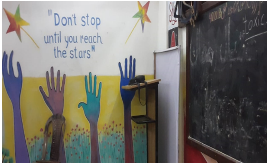
Painted wall to save wall damage