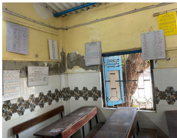
New tiles can be seen in another classroom