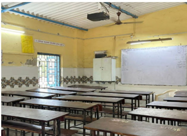
The painted classroom

After the intervention of KEF and KMPL, the school was renovated according to the proposed intervention. The walls were plastered and new tiles were fixed. The walls and roofs of the classrooms were painted, enhancing the children's and teachers' perception of the classroom. These simple redevelopments heightened the feeling of being welcomed and encouraged engagement.