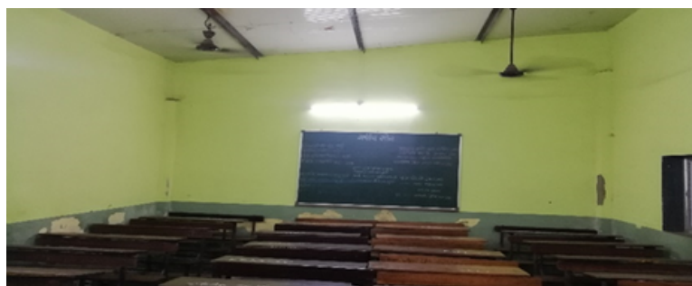
Interior view of the classroom with extended wall