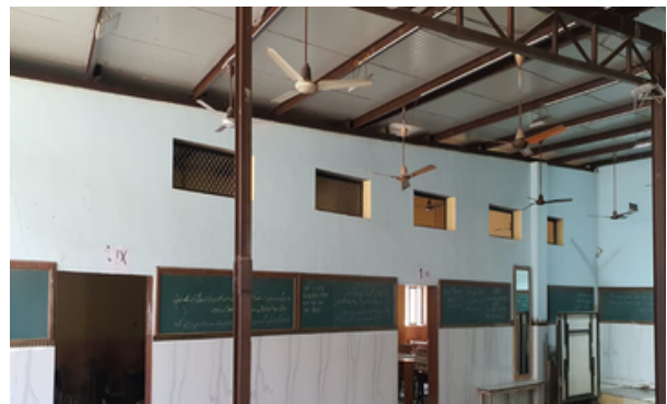
Painted wall and tiles can be visible along with well structure beams