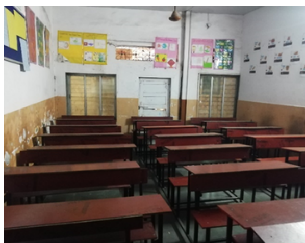
Painted classroom with well ventilated system