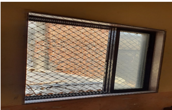
Ventilation system can be found in the classroom

Post KMPL and KEF's intervention for the above-identified issues, the asbestos roofing was replaced with PUF sandwich panels, and a structural steel frame was installed to provide more stability to the structure. To tackle the issue of wide cracks in the walls, existing walls were demolished and new walls were constructed along with plinth beams. Steel and brick columns were added, and plastering of walls was carried out, followed by painting them. Sliding windows along with grills were added, and a ventilation system was developed as well.