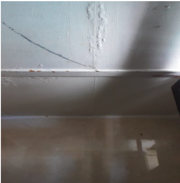
To prevent rusting, beams also painted