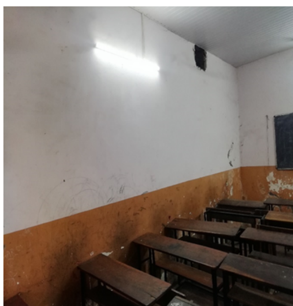
Plastered wall can be found in the classroom