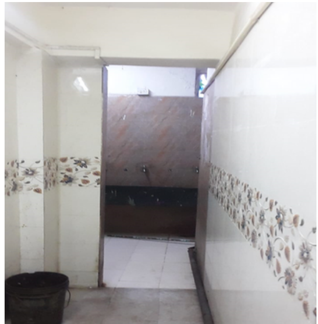
Tiles can be found on wall and floor