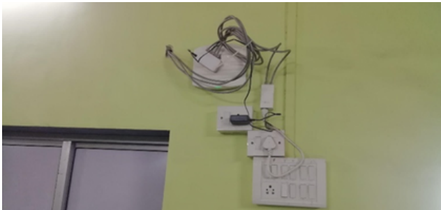
Newly constructed electric board along with wi-fi facility

The proposed intervention for the above-mentioned issues included replacing the asbestos roofing with PUF panels, raising the height of the classrooms by filling the earth and tiling it to prevent water penetration, carrying out plastering on walls and painting and conducting minor electrical work.