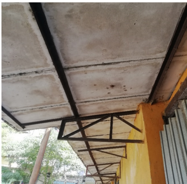
Exterior roof installed to prevent rain water