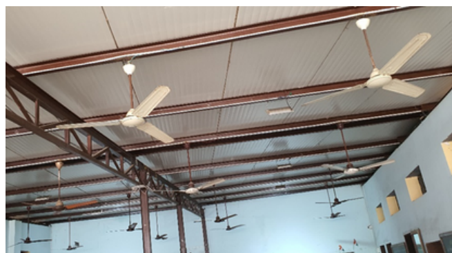
Asbestos replaced with PUF sandwich panels